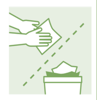
DRY HANDS WITH A DISPOSABLE TOWEL, DON'T SHARE TOWELS