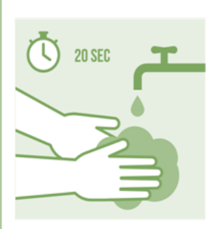
WASH HANDS WITH SOAP AND WATER OR SANITIZER AT LEAST 20 SEC